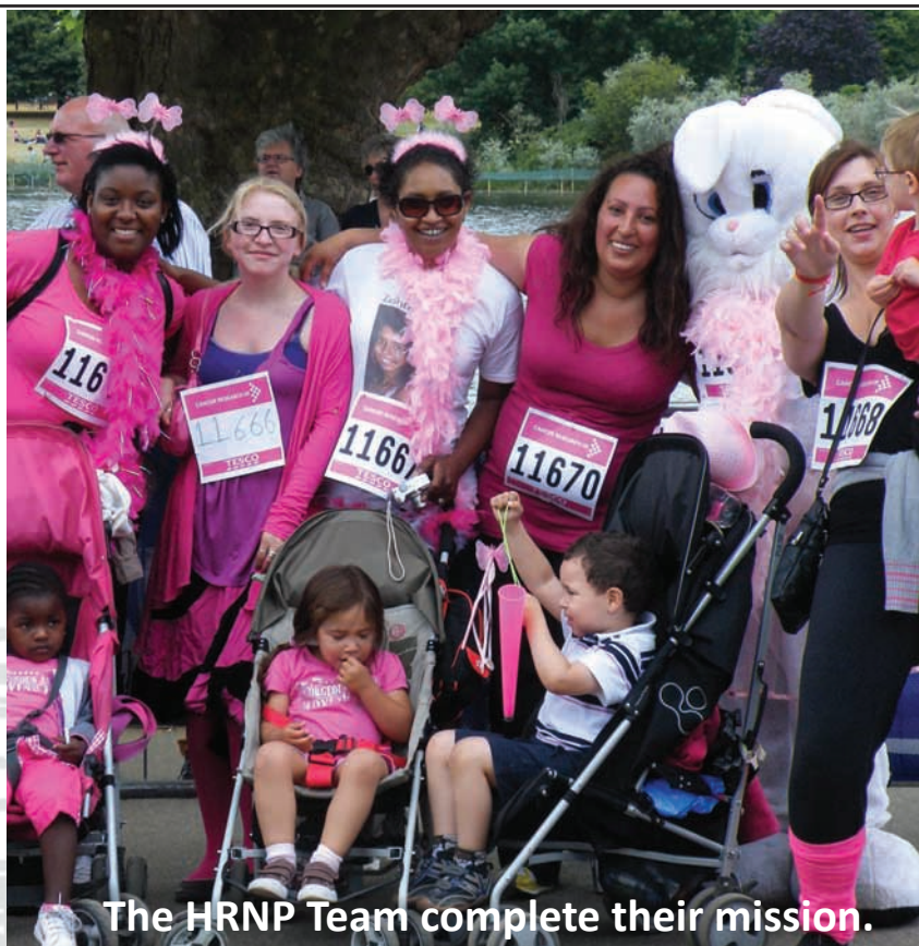
The HRNP Team complete their mission.