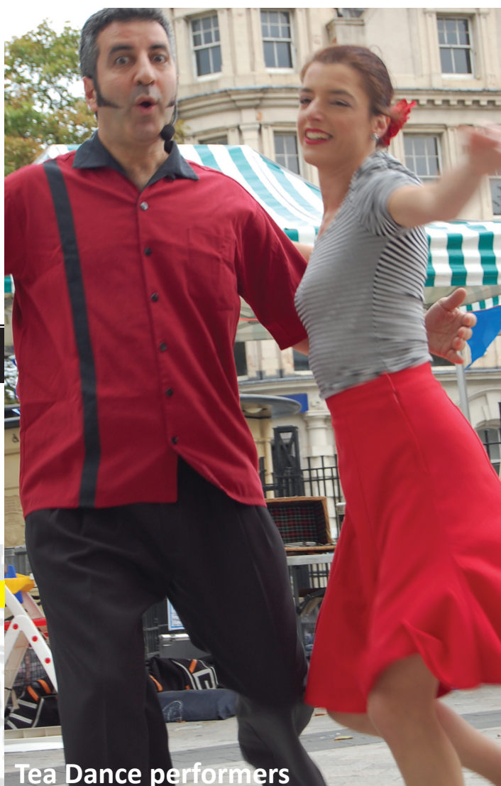
Tea Dance performers