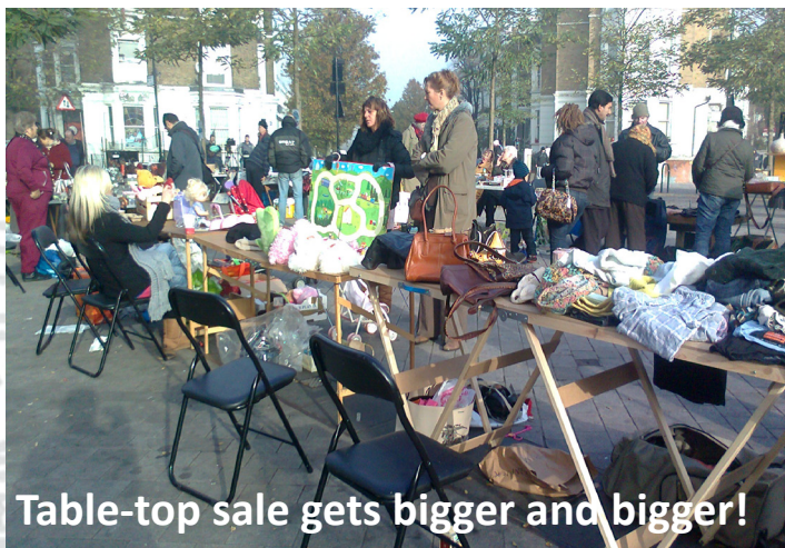
Table-top sale gets bigger and bigger!

In the New Year we will be beginning to run some Clean Up days, so that Maida Hill can begin 2011 in a positive way. If you're interested in setting up or taking part in a Clean Up of your street or local space please get in touch or come along to one of the meetings.