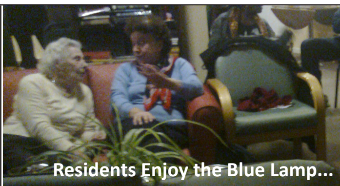
Residents Enjoy the Blue Lamp...

The North Paddington History group continues to meet at The Neighbourhood Centre on the first Wednesday of each month from 4pm. They'll also be having a special meeting on Wed Dec 1st starting with a 2pm local walk. The group recently went on a local expedition taking a photo tour of Harrow Road, and are currently working on a research project with the London Transport Museum, which will be featured in an exhibition at the Museum in February 2011. They have also set up a few great trips and activities recently – including visiting Museum archives, watching the Soho Theatre play 'Tales of the Harrow Road' and holding a showing of the Blue Lamp at Ernest Harriss House. If you would like to get involved in any of this – or have a suggestion for another historical film you'd like to see – please get in touch by emailing hrrp@ghg.org.uk