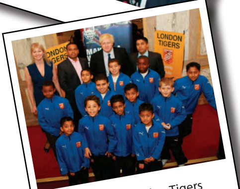
Lisson Green London Tigers

The Annual Achievement Awards Ceremony of London Tigers was held on Thursday 18th of October 2009, at Porchester Hall in Bayswater. The event was attended by over 500 people, including members of London Tigers and their families, special guests - including Mayors, Councilors and MPs from 6 London Boroughs - officers from statutory and voluntary organisations, media and sports personalities and others.